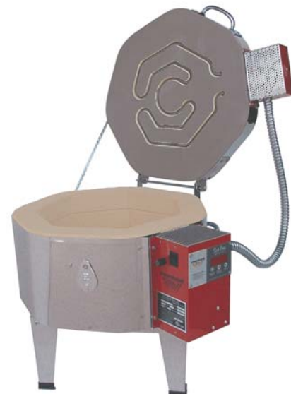
Evenheat Hot Shot Kiln