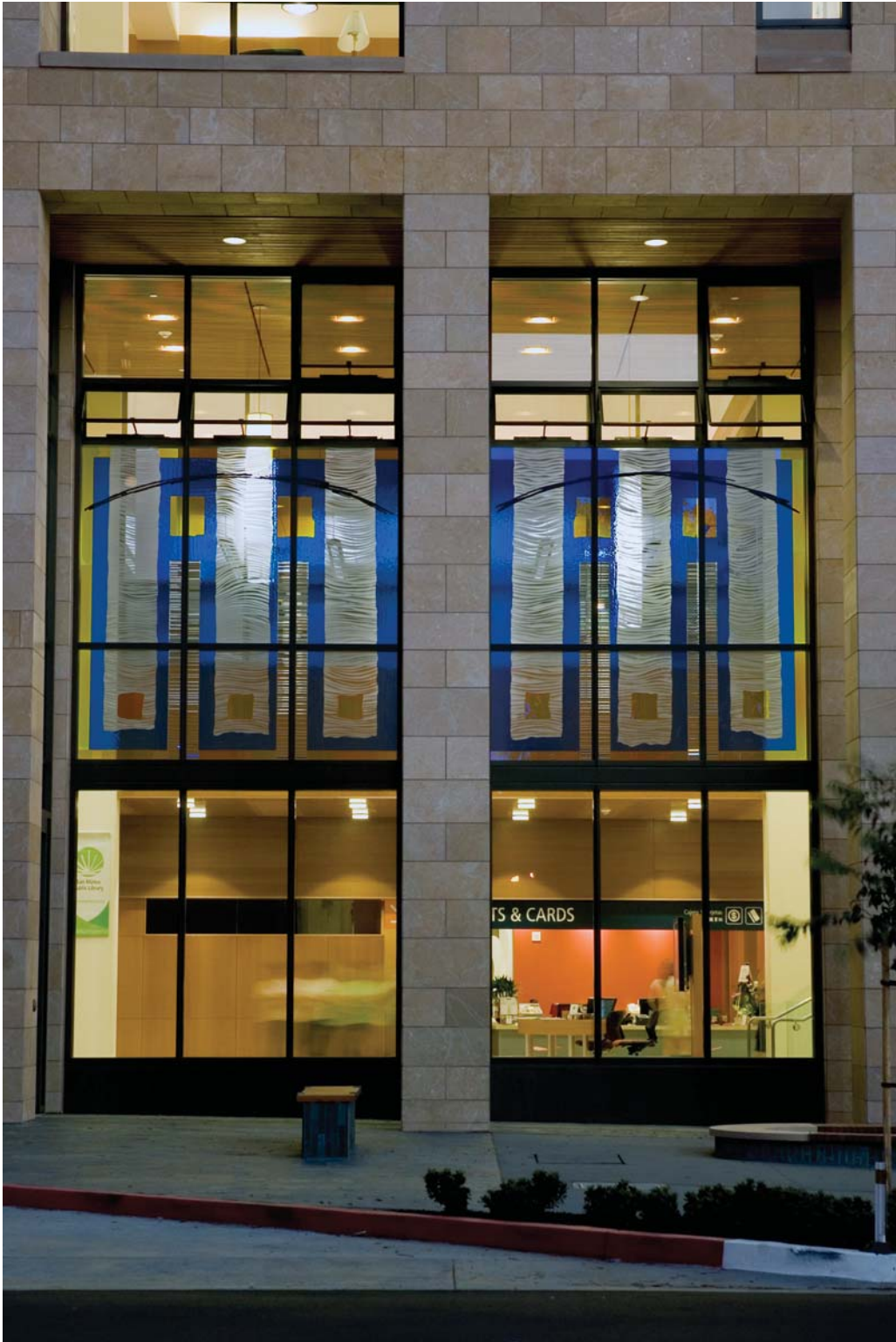
San Mateo Library