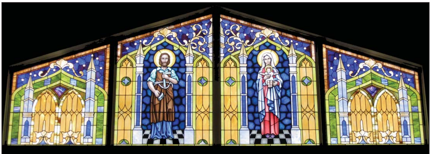
St. Joseph Church, Sugargrove, Ohio. August 2009, 192" x 68"

Since 1924, Franklin Art Glass Studios has been producing fine handcrafted stained and leaded glass. Known for quality craftsmanship, Franklin Art Glass Studios has produced an array of stained glass items for homes, offices, restaurants, businesses, and churches in their more than 85 years in business. www.franklinartglass.com .