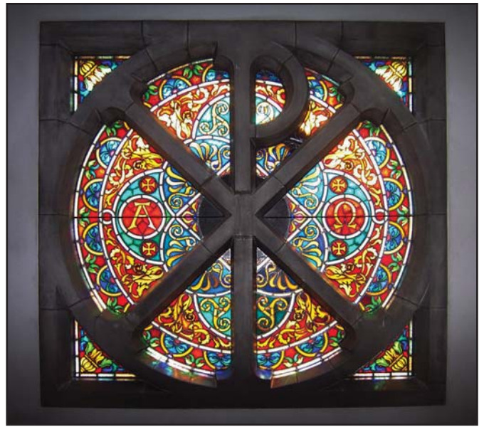
Greek Orthodox Church installation by Pike Studios.