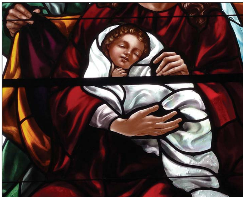
Three of the windows at Holy Family Mausoleum depict the Holy Family. The window shown above and detail, right, depicts Joseph and Mary with the infant Jesus.